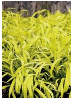
Ornamental Millet 'Flashlights'