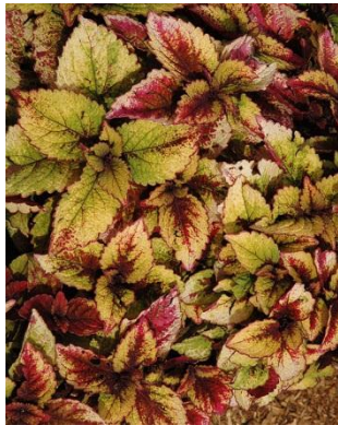
Coleus 'Honey Crisp'